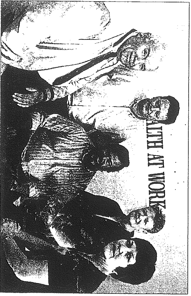
HEALTH AT WORK

chemicals leaked into the air around their plants.